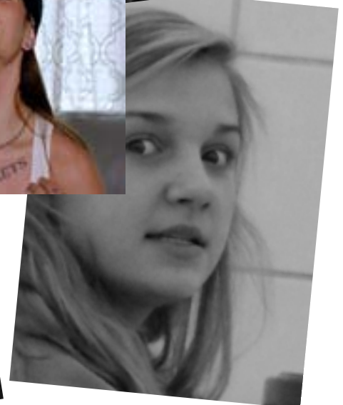
1. Nose. 2. A Stamp. 4. 69 Years.